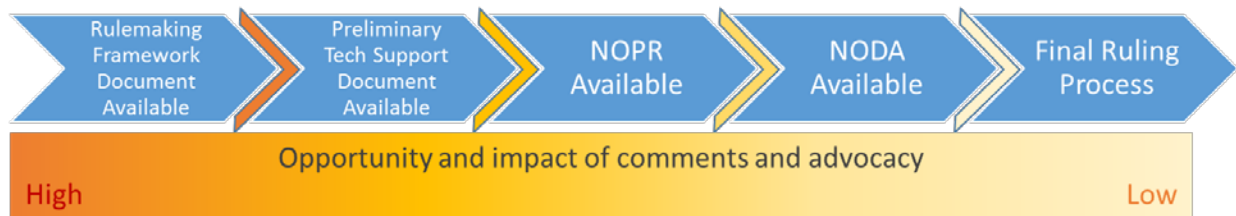
Figure 1. DOE Standard Development Process and Opportunities for Stakeholders’ Influence

Although DOE seeks input throughout the development process, TRC’s literature review and interviews with efficiency stakeholders found that comments received at the initial stages are more likely to affect the direction of the development process and the final standard adopted. Two representatives from efficiency stakeholder organizations reported that comments provided to DOE earlier in the development process are more likely to have greater influence on the final standard, because the DOE has not performed extensive analysis at this point and is more open to input and changes in standard direction. The DOE has a set timeline and limited resources, so it does not have opportunity to make significant changes to the standard or perform additional analysis in the latter stages of the process. Therefore, it is advantageous for stakeholders to be active during public meetings and comment periods between release of the rulemaking framework document and release of the Notice of Proposed Rulemaking (NOPR), rather than when the DOE releases the Notice of Data Availability (NODA). TRC developed Figure 1 to illustrate the general DOE standard development process and opportunities for stakeholder input.