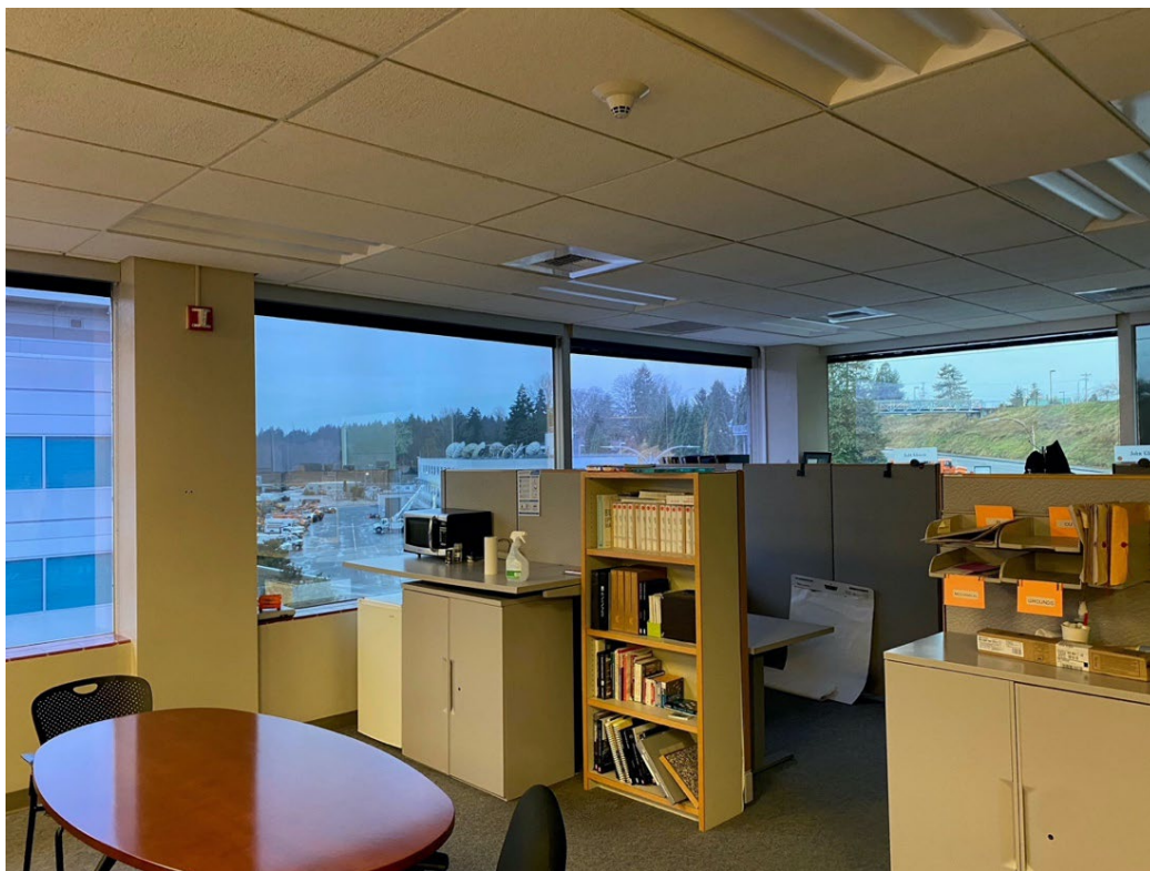
Figure: Photo of Site 1 Window from Interior of Building in Tacoma, WA

The non-glass window attachments were tested in three unique spaces located within two commercial buildings: Site 1 was a commercial administrative office building located in Tacoma, Washington, with large single-glazed windows, and Site 2 was a historic commercial office building in Seattle, Washington, with relatively smaller operable windows constructed with multiple glass lites held together by wood muntins in wood sashes in a wood frame windows. The Site 1 windows feature a single sheet of glass without mullions and surround an open plan office with cubicles. Although occupancy was low due to COVID-19 restrictions, the Site 1 office would normally house several occupants serving a customer service call center. Two spaces within Site 2 were used for testing, where one space was occupied by office staff and the other space was a common area (e.g., conference room) and was intermittently occupied. Occupancy at Site 2 was also lower than normal during the testing due to COVID-19 onsite work restrictions. Both sites are located within International Energy Conservation Code (IECC) Climate Zone 4C.