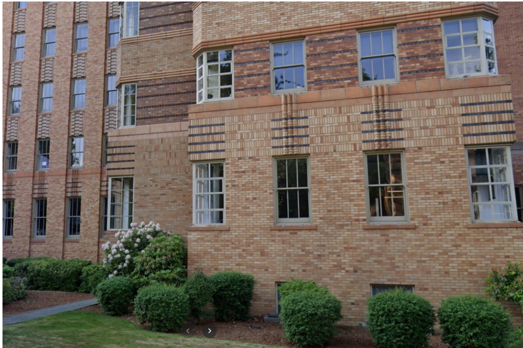
Figure: Photo of Site 2 Historic Building in Seattle, WA