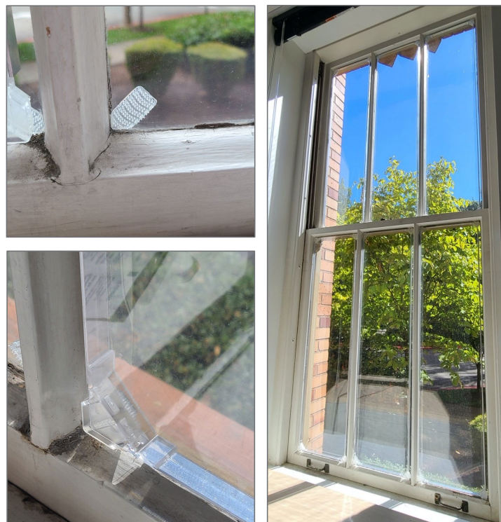
Figure: Glazing-Mounted Copolyester Panels