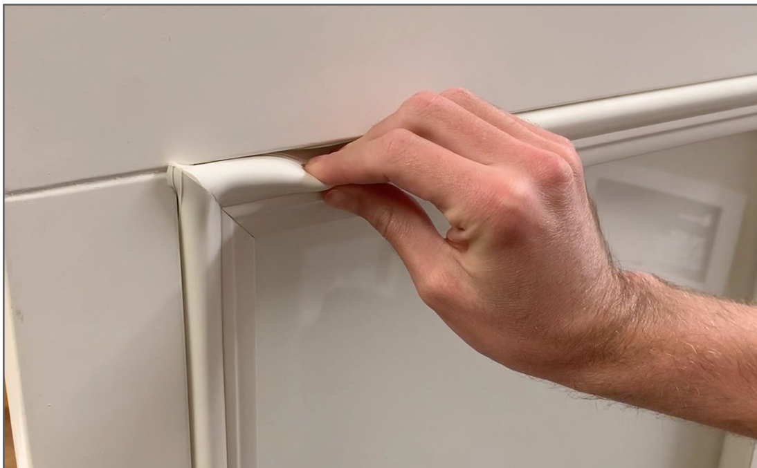
Figure: Frame-mounted acrylic panel with vinyl + weatherstripping perimeter seals

The frame-mounted acrylic panel with vinyl + magnetic perimeter seal product requires the installation of light gauge (~24 gauge) metal L-angle stock or flat metal stock into the window frame first to create a magnetic surface for the magnets in the panel's frame to stick to. The acrylic products hold themselves to the window frame using friction. The glazing-mounted copolyester panel product comes with clear adhesive-backed mushroom snap-together connectors that are installed onto the window glass surface. These mushroom snap-together connectors are like the more commonly known hook-and-loop fasteners; but unlike hook-and-loop fasteners, they have a field of tiny hard plastic mushrooms that allows the product to mate to itself with a fastener.