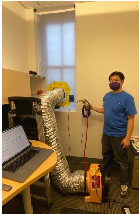
Figure: Test Setup for Measuring the Air Leakage of an Individual Window

Across all non-glass products tested, it would appear that there would be some distinct installation advantages relative to full replacement or their secondary window glass counterparts. These advantages include the lighter weight and flexibility of these non-glass panels. The copolyester panels, in particular, were very light, flexible, and extremely easy to install and were acquired for the lowest cost. Thermal comfort benefits were measured for all three panels, with the copolyester panel yielding the greatest change in temperature to the interior panel. Significant air leakage and sound reductions were measured for both acrylic panels. The aesthetics, glare, and clarity features of the interior panels were generally viewed favorably by the building occupants. These findings are summarized in the table below.